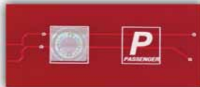
Passenger Side marking

Each LED panel is marked Driver and Passenger side.