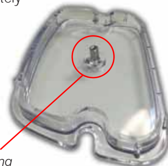
Mounting Stand -off.

2. Screw the included standoff into the lens. The LED panel will ultimately be held in place by sitting against the housing.